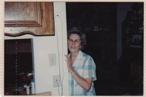
Note from Mimi