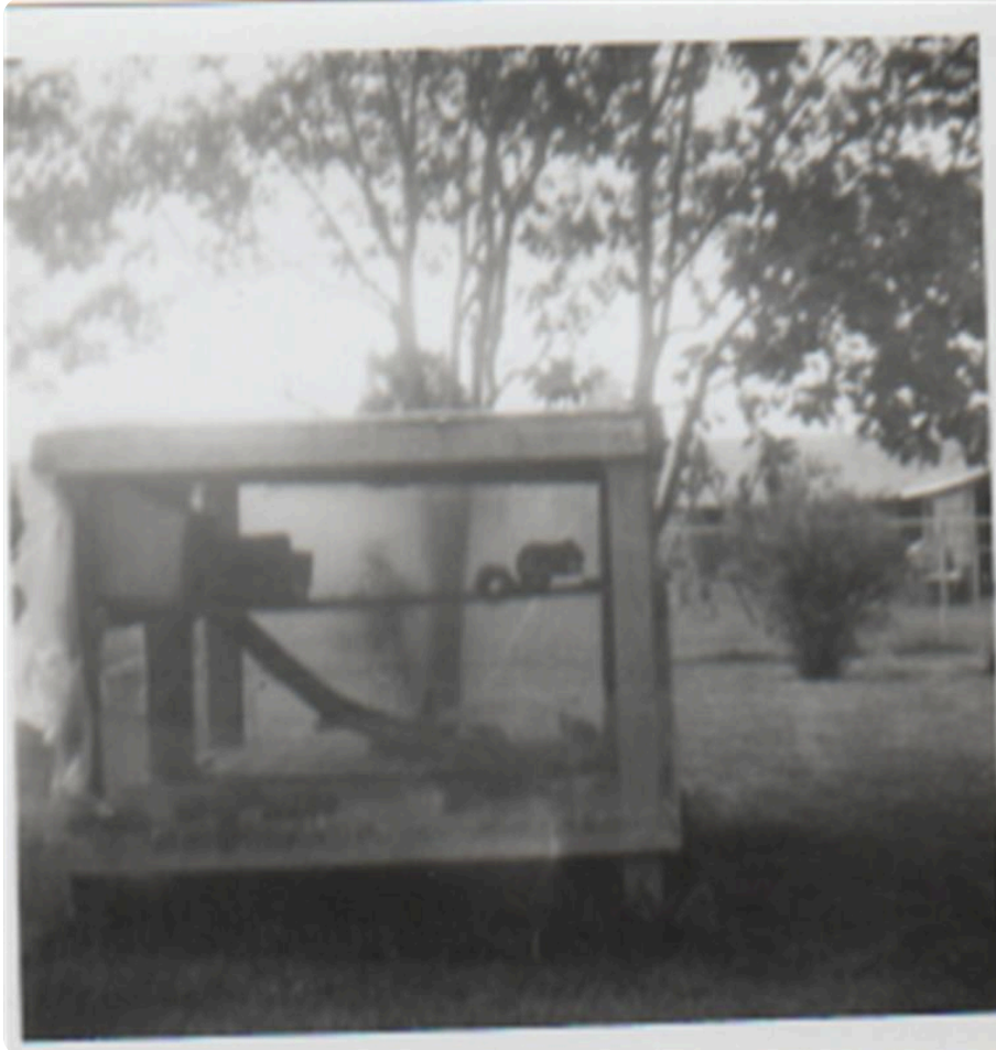
Poncho's pet squirrel